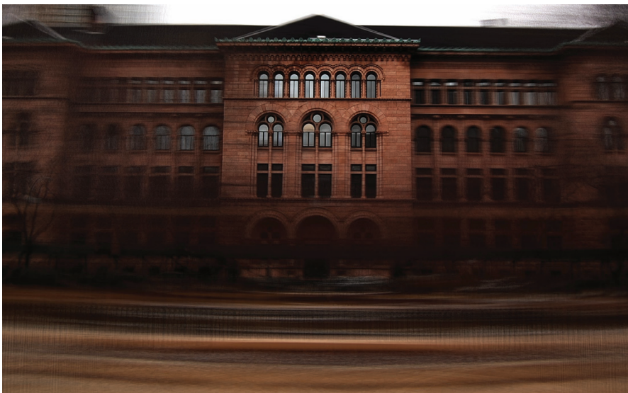
A photo containing 62 frames, taken through a group of trees, of Chicago’s Newberry Library.

But in developing a programmable platform for researchers in computational photography, Levoy faces several